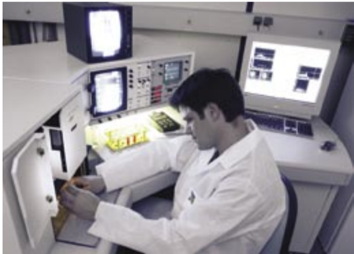
TCl, Hannover