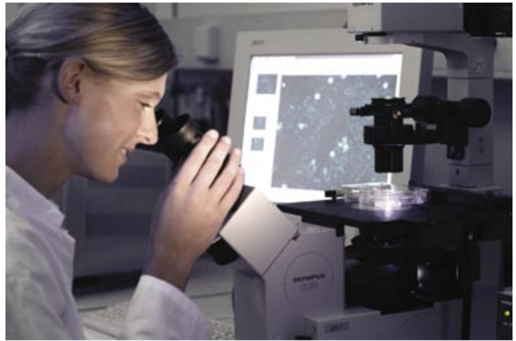
TCl, Hannover

Registered conference delegates will be informed of abstract acceptance by February 28 th 2008